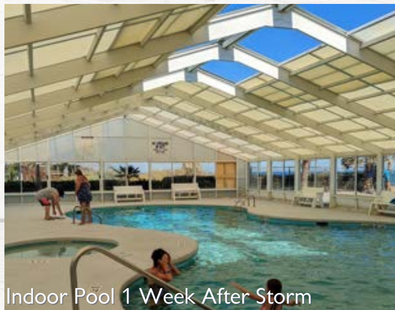
Indoor Pool 1 Week After Storm