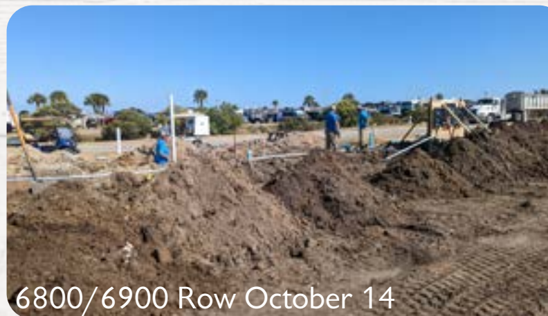
6800/6900 Row October 14