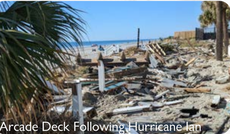
Arcade Deck Following Hurricane Ian

The deck behind the Arcade, which was just refurbished last spring, also took a heavy hit from the storm. It will remain closed for some time as we work to rebuild the deck and railings.