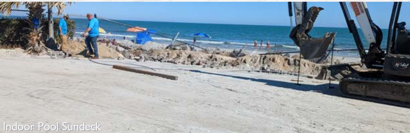
Indoor Pool Sundeck