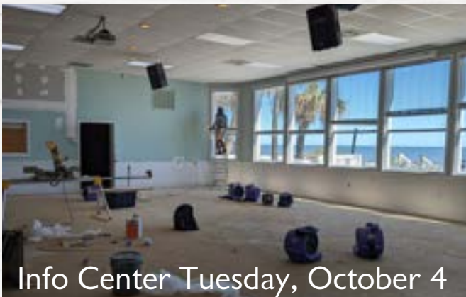
Info Center Tuesday, October 4