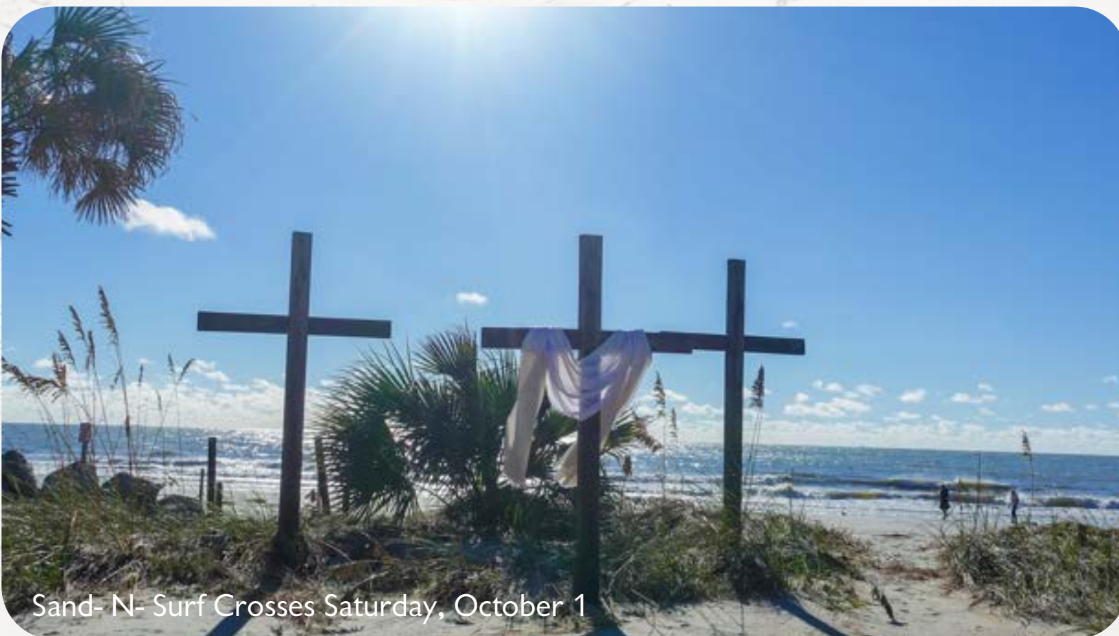
Sand- N- Surf Crosses Saturday, October 1

A beautiful reminder of God's Grace & protection.