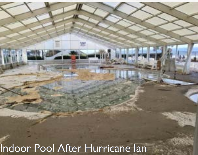
Indoor Pool After Hurricane Ian

The Indoor Pool, which was overcome by water & sand during the storm, re-opened just 7 days after the hurricane came ashore. Our aquatics team worked hard in the days following the storm to remove sand from the pool deck, the pool and its mechanical system. The sun deck behind the Indoor Pool was severely damaged during the storm. Work to repair it is already underway.