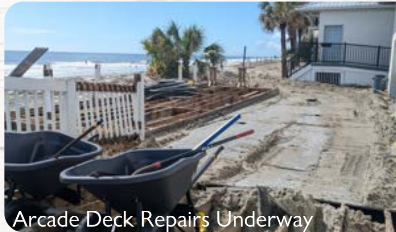
Arcade Deck Repairs Underway

The north end of the resort was another area hit hard by Hurricane Ian. The storm surge paired with the king tide forced sand and water onto the 6700, 6800, 6900, 7000 and 7100 rows. The pedestals serving sites on the 7000 and 7100 rows were damaged beyond repair. Fortunately, our team already had plans to replace these pedestals in the winter and we already had the replacements on hand. Work to get those sites back online is well underway and is expected to be complete by early November.