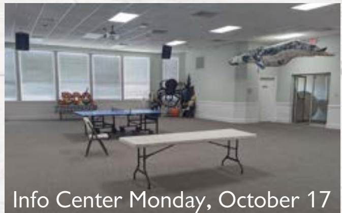
Info Center Monday, October 17